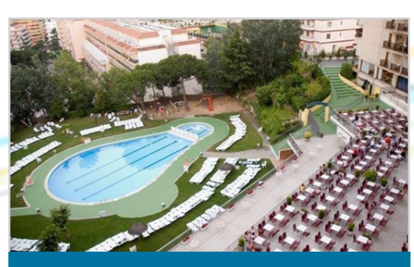
Figure 1 demEAUmed demonstration site (Samba Hotel)

the 172 nm UV treatment, with an improved software and optimized lamp frame and electrical driver, are ready to be tested. Read more here